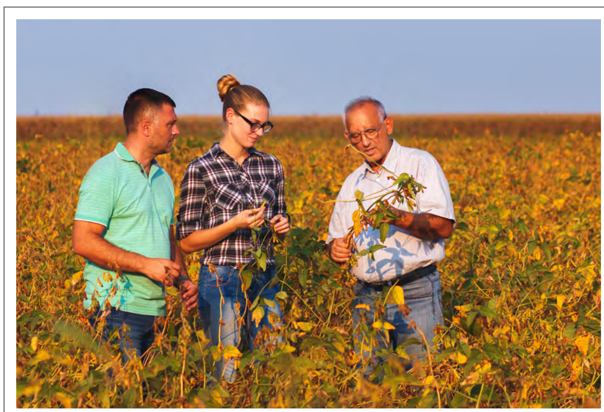
Ag Educator works with beginning farmers