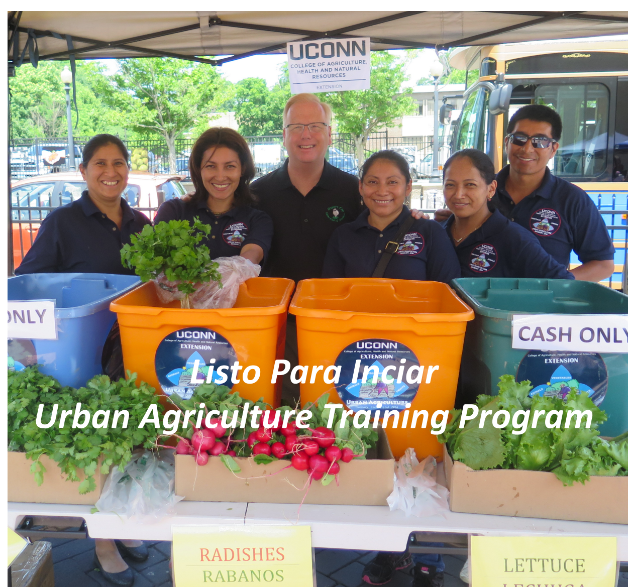
Urban Agriculture Training Program