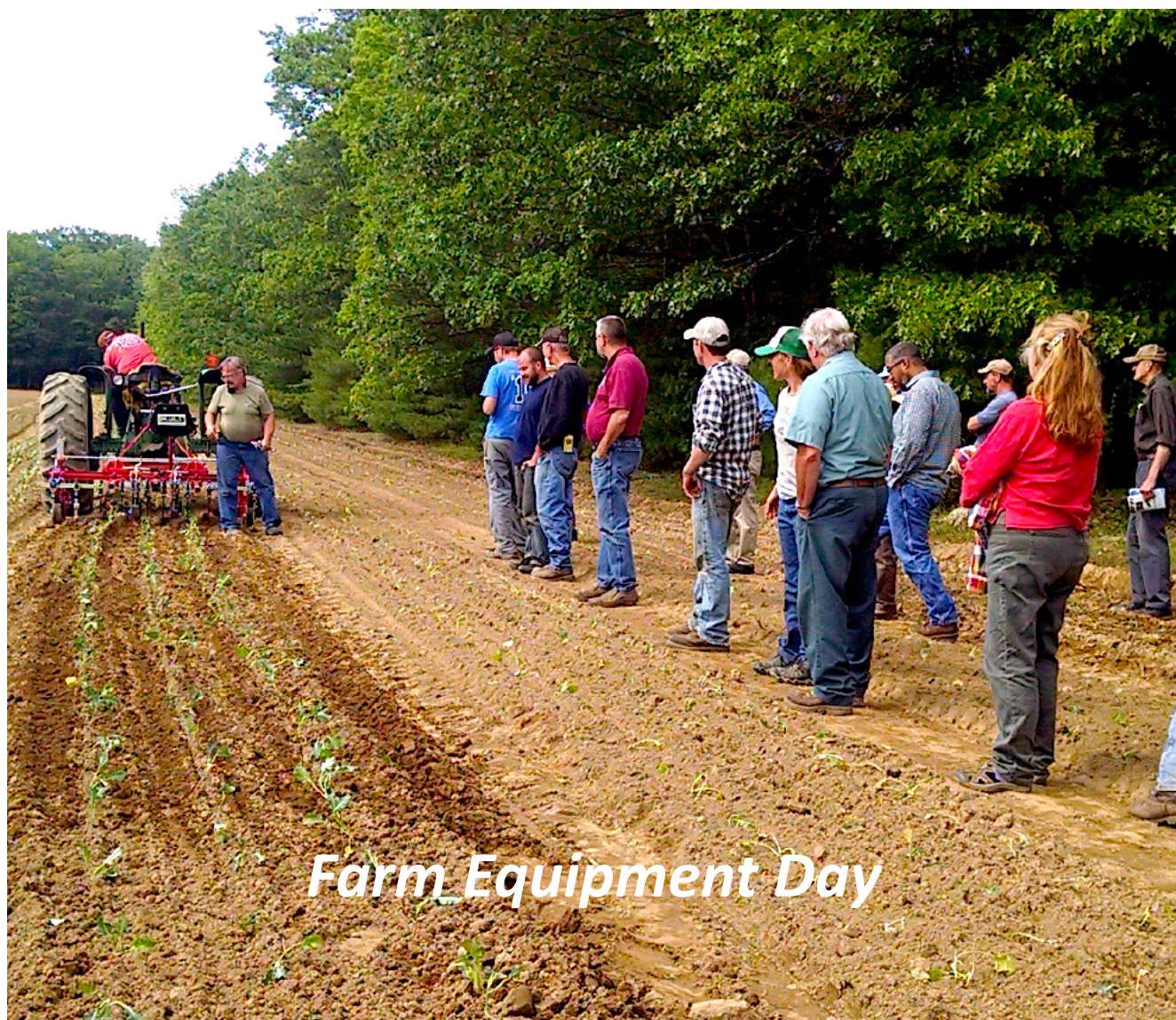
Farm Equipment Day