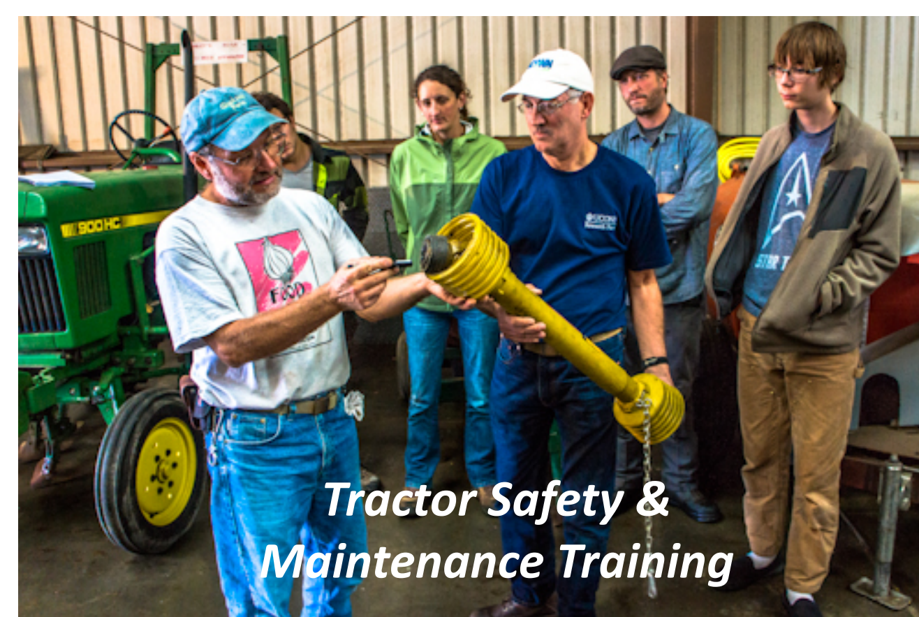
Tractor Safety & Maintenance Training