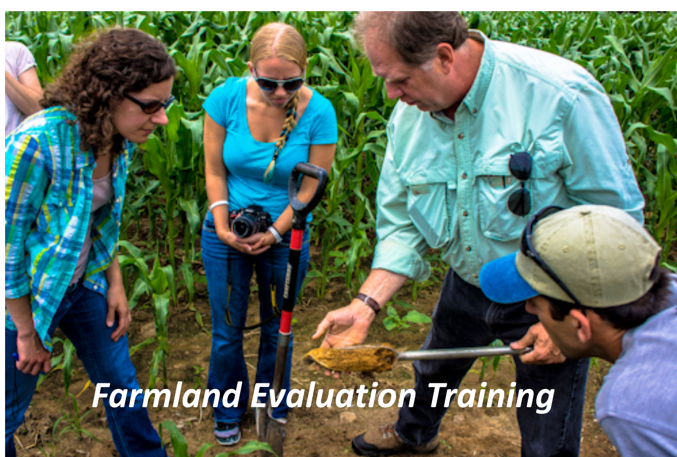
Farmland Evaluation Training