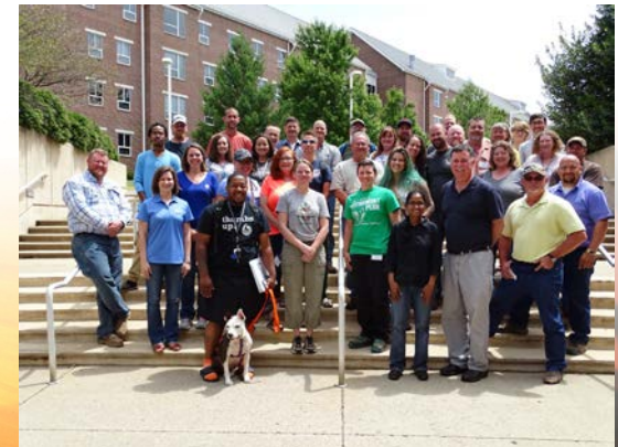
2017 Armed to Farm Group & Feedback

“I loved all the information provided and everyone’s willingness to just want to help and answer questions.”